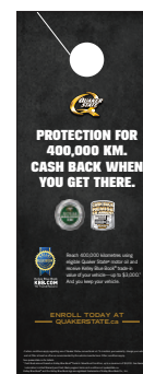
1033345CA Mirror hanger

Cash Back amount based on Kelley Blue Book® Trade-In Value/Good Condition, up to a maximum of $3,000. See Quaker State Lubrication Limited Warranty and Cash Back program terms and conditions at quakerstate.ca . Kelley Blue Book is a registered trademark of Kelley Blue Book Co., Inc.