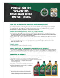
6101878 FAQ sheet